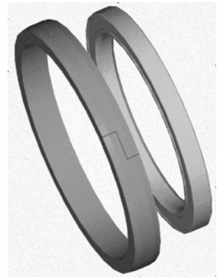
The HDP 330 piston seal withstands extreme pressure up to 800 bar.

The special polyamide seal HDP 330 complements the Merkel piston seal program for the installation space DIN ISO 7425-1. It withstands the most extreme pressures (up to 800 bar) and allows for use of rougher cylinder liner surfaces, which can cut cylinder production costs.